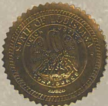
John Bel Edwards Governor

IN WITNESS WHEREOF, I have hereunto set my hand officially and caused to be affixed the Great Seal of the State of Louisiana, at the Capitol, in the City of Baton Rouge, on this 1st day of March A. D., 2022.